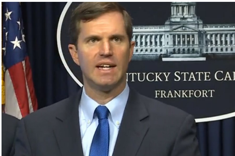
Kentucky Gov. Andy Beshear requested today (March 11) that houses of worship cancel services at least through Sunday (March 15) to deter spread of the new coronavirus.