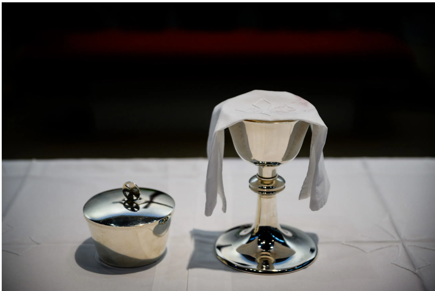
Immanuel Lutheran Church in Amherst, Massachusetts.