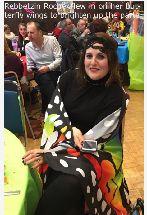
Rebbetzin Rochel flew in on her butterfly wings to brighten up the party