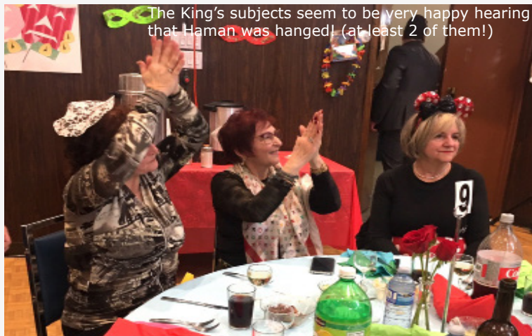
The King's subjects seem to be very happy hearing that Haman was hanged! (at least 2 of them!)