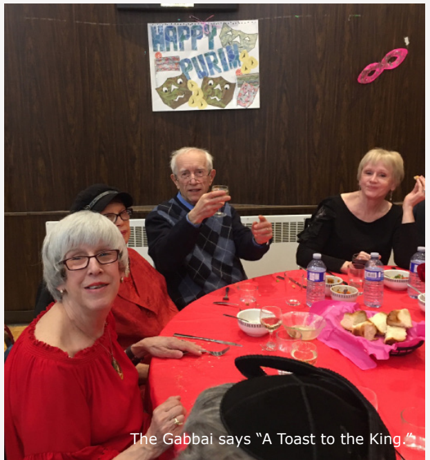
The Gabbai says "A Toast to the King"