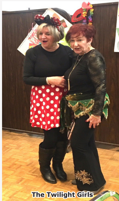
The Twilight Girls