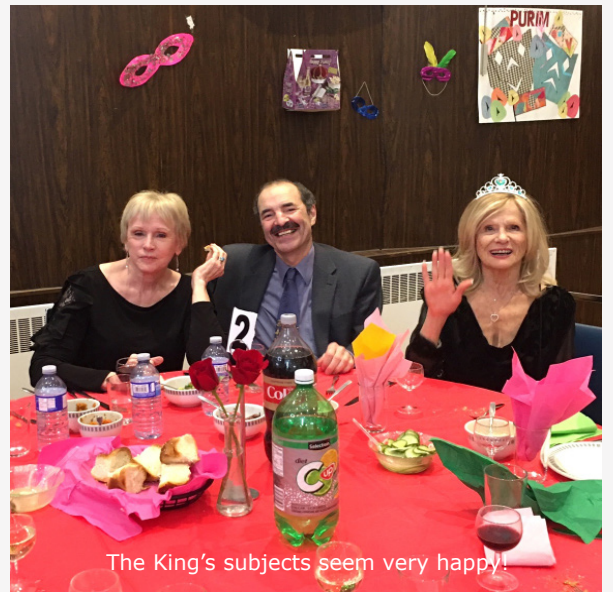
The King's subjects seem very happy!