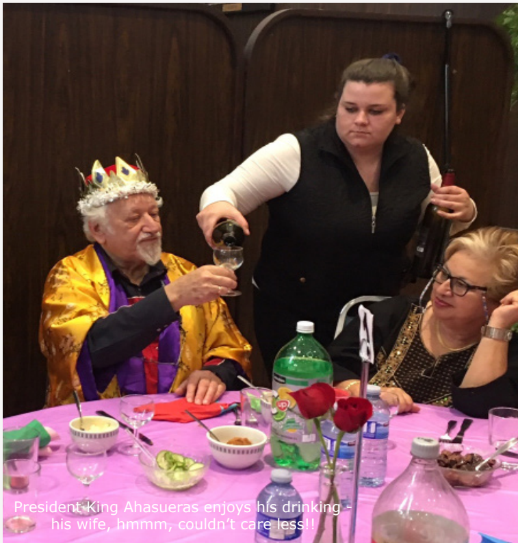
President King Ahasueras enjoys his drinking - his wife, hmmm, couldn't care less!!