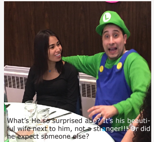
What's He so surprised abo? It's his beautiful wife next to him, not a stranger!!! Or did he expect someone else?