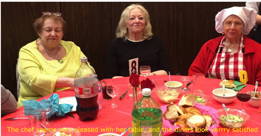
The chef seems very pleased with her table, and the diners look verry satisfied