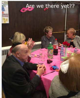
Are we there yet??