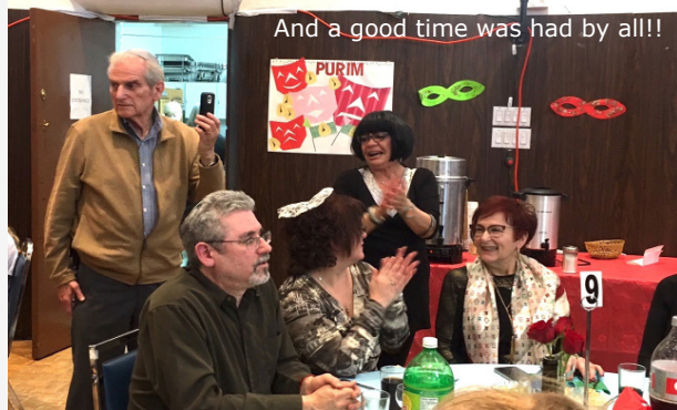
And a good time was had by all!!