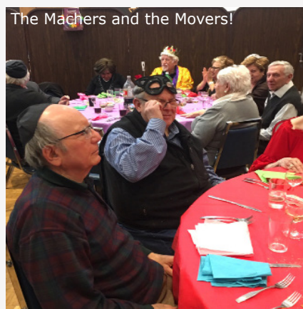
The Machers and the Movers!