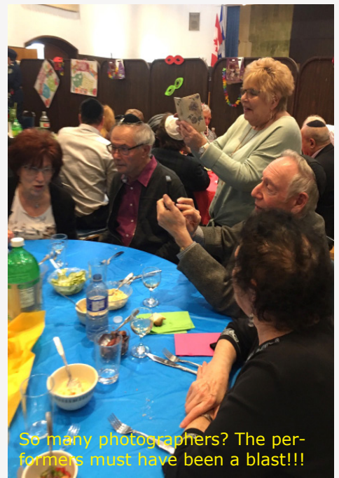
So many photographers? The performers must have been a blast!!!