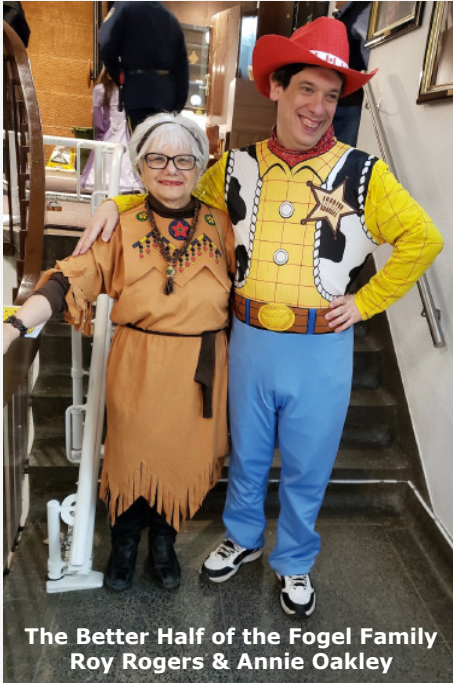
The Better Half of the Fogel Family Roy Rogers & Annie Oakley