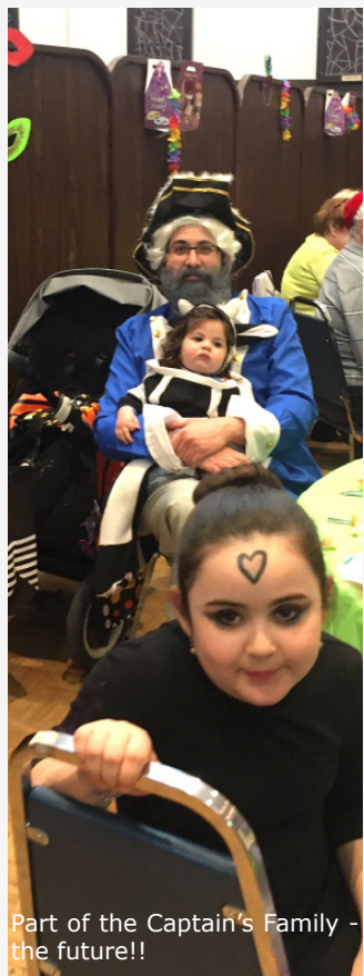
Part of the Captain's Family - the future!!