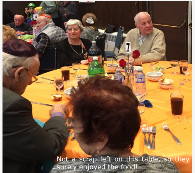
Not a scrap left on this table, so they surely enjoyed the food!