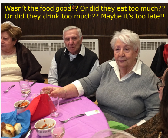
Wasn't the food good?? Or did they eat too much?? Or did they drink too much?? Maybe it's too late!!