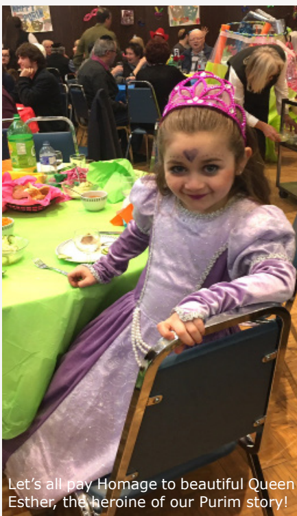
Let's all pay Homage to beautiful Queen Esther, the heroine of our Purim story!