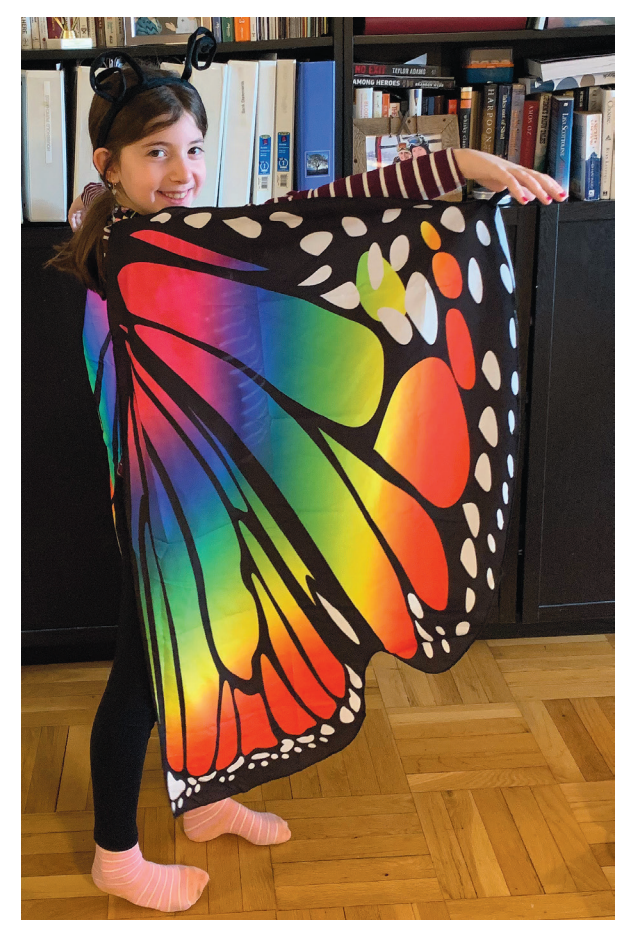
Finding happiness in the little things

"I think parents of children with special needs know how to focus on the things that really matter," Rabbi Rothwachs said. "They have the broader perspective, and they are used to the curveballs that life throws at