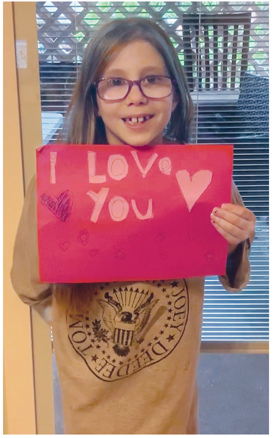
Students sent notes and photos to their teachers expressing their gratitude.