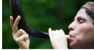
Breath of Light: A Meditation on Blowing of the Shofar