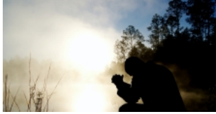
The Voyage Home: A Prayer for Re-Entry after Rehab